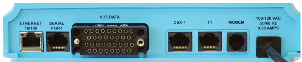
T1 CSU/DSU model 807-0112 rear view