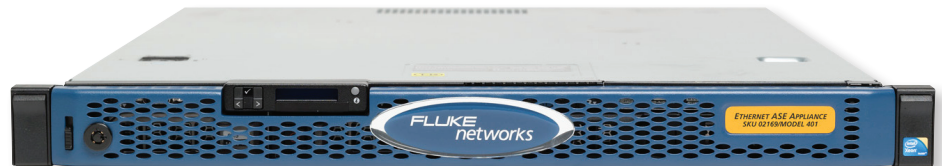
Ethernet Inline ASE front view

Fluke Networks LinkSafe™ feature incorporates intelligent bypass relay technology to protect circuit connectivity in case of power failure.