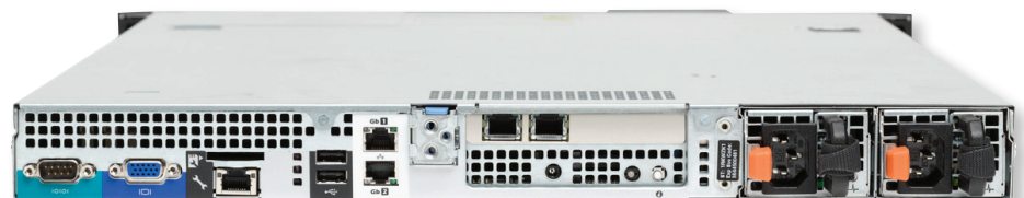
Ethernet Inline ASE rear view