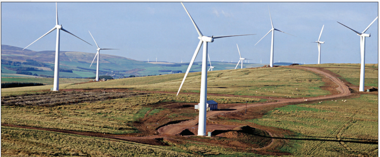
For our customer’s privacy, this photo is a representation of the actual site.

The HV14000 was determined to be the most cost-effective and proven solution, providing complete load immunity from all line disturbances and power interruptions, without any disruption or loss of AC and DC output power. This rugged UPS provided the required rapid recharge current to the batteries, provided the required amps of power to the “standing” DC loads, and provided more than ample power to the substation AC loads.