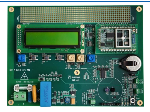
ZDM-01 with ZMM-01 module installed

ZigBee offers green and global wireless standards connecting the widest range of devices to work together intelligently and help you control your world. The ZigBee Alliance is an open, non-profit association of approximately 400 organizations driving development of innovative, reliable and easy-to-use ZigBee standards. The Alliance promotes worldwide adoption of ZigBee as the leading wirelessly networked, sensing and control standard for use in consumer, commercial and industrial areas. For more information, visit: www.ZigBee.org.