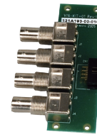
Video Input Daughter Board With 4 x BNC Connectors