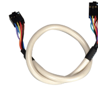
2x4p 2.54mm Cable