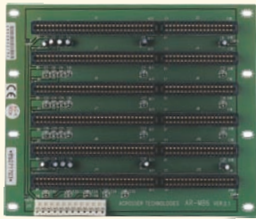
AR-MB6 6 slot ISA-Bus Passive Backplane