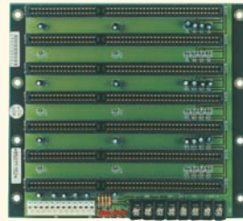
AR-MB7 7 slot ISA-Bus Passive Backplane