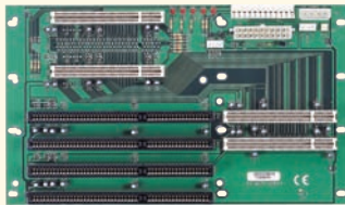
AR-MB7P 2 ISA/2 PICMG/3 PCI Slot Passive Backplane