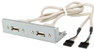
3.5" compact drive bay with USB port