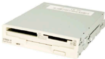
3.5" 7-in-1 compact drive bay