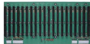
HBP-20SD (by order)