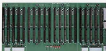
HBP-20SQ (by order)