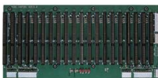
HBP-20S (by order)