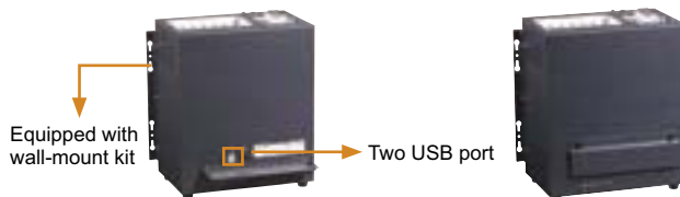
Equipped with wall-mount kit