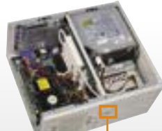
Two USB ports