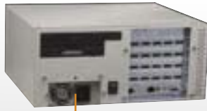
150/200 AT/ATX power supply