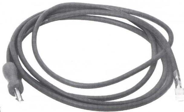
Cat. No. SLP-3PR

Hampden Grounding Cord Sets are widely used in hospitals, particularly in electrically susceptible patient locations, such as the Intensive Care Units, to assure that all conductive surfaces within reach of the patient (or anyone who may touch the patient) are at a common electrical potential.