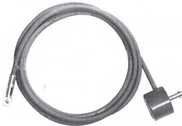
Cat. No. SL-3SQ