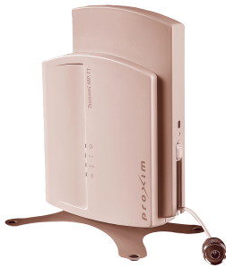
5054 Indoor Base Station