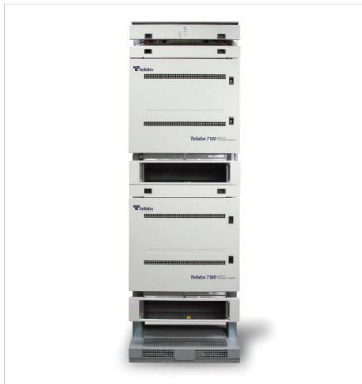
Figure 1. Tellabs 7100 Optical Transport System

The Tellabs 7100 OTS overcomes the shortcomings of early generation Dense Wavelength Division Multiplexer (DWDM) systems by introducing a multi-degree ROADM architecture based on Wavelength Selective Switching (WSS) technology. This architecture simplifies network engineering, solves the stranded capacity issues that can occur as a result of channel banding and eliminates re-engineering to accommodate moves and changes. New services can be added on a “point and click” basis through the Tellabs® 7194 Network Management System (NMS), enabling rapid service rollout and the quick addition of new revenue streams.