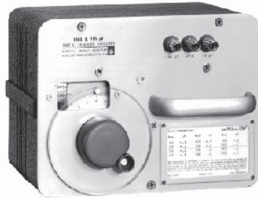
Model 1422 Precision Capacitor

A worm drive is used to obtain high precision of setting. To avoid eccentricity, the shaft and the worm are accurately machined as one piece. The worm and worm wheel are also lapped into each other to improve smoothness. The dial end of the worm shaft runs in a self-aligning ball bearing, while the other end is supported by an adjustable spring mounting, which gives positive longitudinal anchoring to the worm shaft through the use of a pair sealed, self-lubricating, preloaded ball bearings. Similar pairs of preloaded ball bearings provide positive and invariant axial location for the main or rotor shaft. Electrical connection to the rotor is made by means of a silver-alloy brush bearing on a silver-overlay drum to assure a low-noise electrical contact.