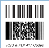
RSS &amp; PDF417 Codes