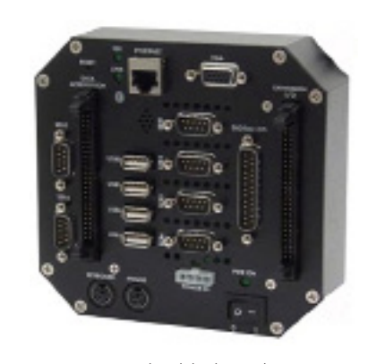
Octavio-HLV Embedded Application Server