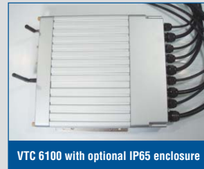
VTC 6100 with optional IP65 enclosure