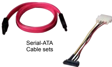
Serial-ATA Cable sets