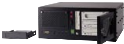
5.25" to Drive Bay