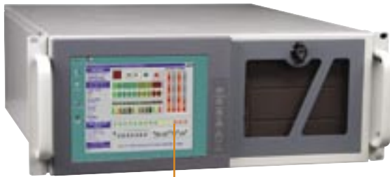
DM-84T LCD Module