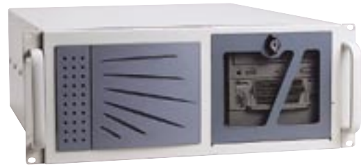
MPC 6010AW Basic Model (No Display)