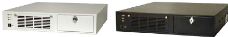
RACK-220GW / 221GW