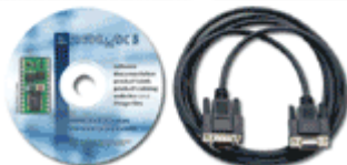
BASIC Stamp 1 Starter Kit