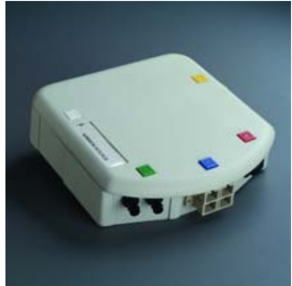
Workstation Multimedia Outlet | Photo ICH95

The WMO can be surface-mounted on a single-gang electrical box (2 x 4 in), or a dual-gang electrical box (4 x 4 in). Surface raceway can be inserted into each connector panel location or into the top of the unit. This allows for the large diversity of installation and cable routing methods.