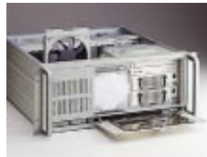
Hot-swap cooling fan and easy maintenance air filter