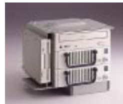
Shock-resistant disk drive bay with 3 x front-access half-height, 1 x 3.5" disk drive and one internal 3.5" HDD