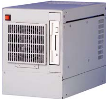
LVDS Module Interface