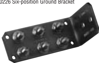
AX100226 Six-position Ground Bracket

Two Ground Wire Clips on each side of the ground wire are required to ground one cable.