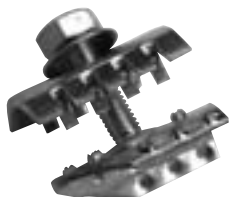
X9905753 Bond Clamp

PNCI Ground Wire consists of 6, 10, 12 and 14 AWG Solid annealed copper conductors individually insulated with polyvinyl chloride compound.