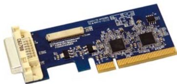
ADD2-DVI-Dual Part #820952