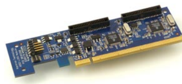
ADD2-LVDS-Dual Part #820950