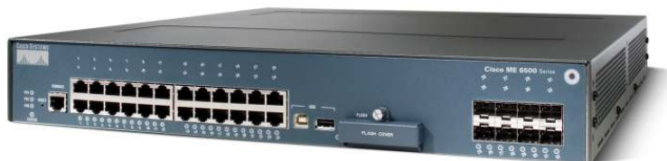
Figure 2. Cisco ME 6524 with 24 Ethernet 10/100/1000 Downlinks

The Cisco ME 6524 Ethernet Switch is shipped with the IP Base Software image. The image includes the Layer 2 feature set, RIP, and EIGRP stub.