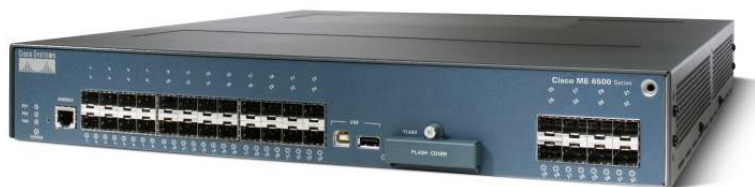
Figure 1. Cisco ME 6524 with 24 Gigabit Ethernet SFP Downlinks