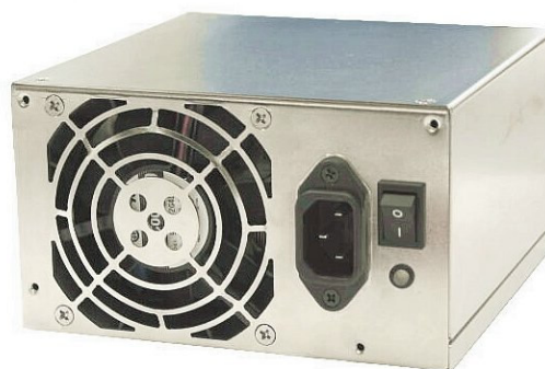
Dimensions: 150(W) x 86(H) x 150(D) mm