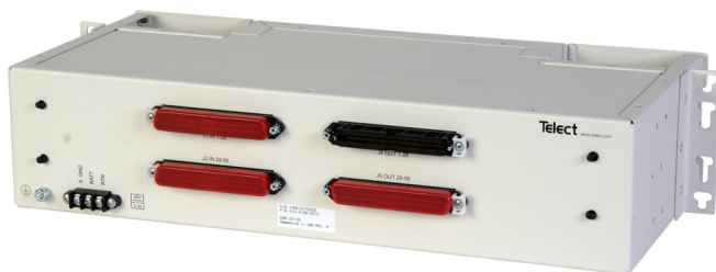
Rear View, Connectorized Panel