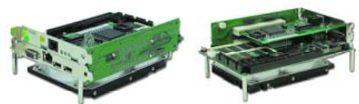
Expand the PCI SBC with converter board