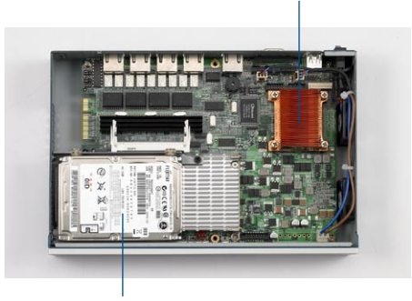
2.5" IDE HDD

Removable cover allows easy maintenance and software upgrade