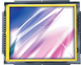
Open Frame Type