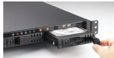
Dual front-accessible SATA HDD trays