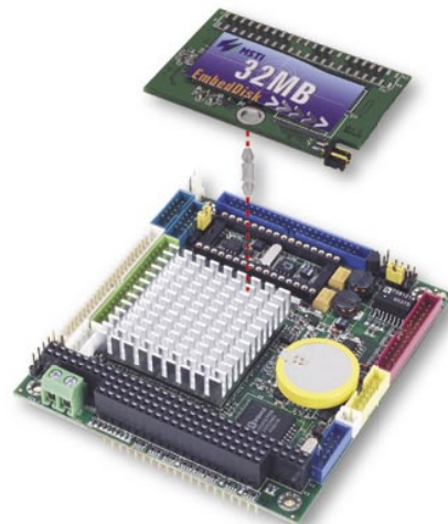
Fixed hole for Flash Disk