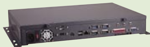
EB-4800 Embedded Chassis for POS-370/566