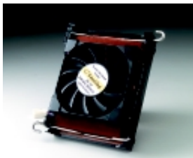
Part Number: VTC487016 Slim fan for 1U chassis