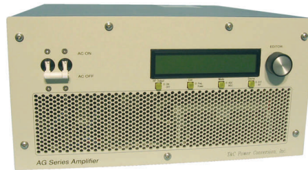
Power Supply Front Panel View

Amplifier Model AG 1010 is a robust source of RF power for ultrasonic, laser modulation, RF/EMI, plasma generation, laboratory and general industrial applications.