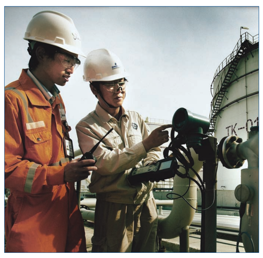
Designed not only for use on the bench, the 375 Field Communicator also enables you to do those tasks that just have to be done in the field.