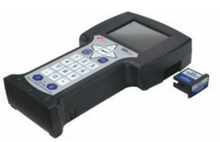
The Configuration Expansion Module safely stores hundreds of device configurations.

Together, the 375 Field Communicator and AMS Device Manager enable you to efficiently manage all of your devices, the assets that are the foundation of your process.