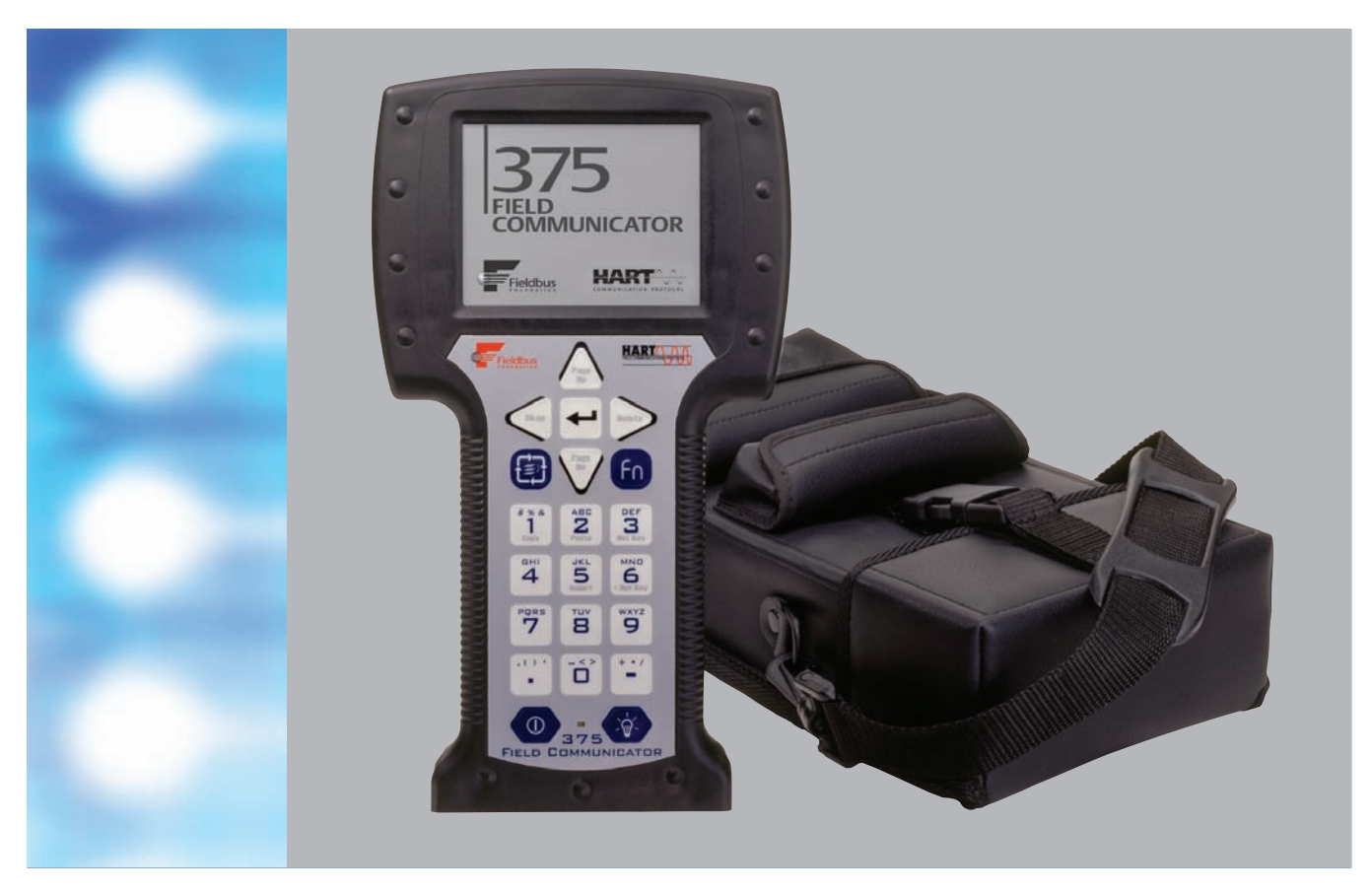
The 375 Field Communicator, with its handy carrying case, provides a single tool for configuring and diagnosing HART and FOUNDATION fieldbus devices.