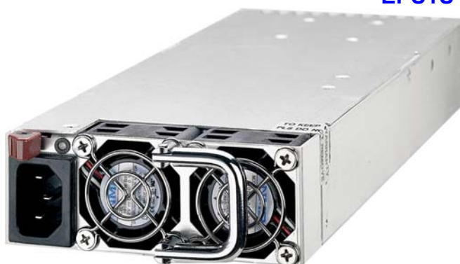
Dimensions: 106(W) x 40(H) x 266.9(D) mm

460 watts Output Power N+1 Redundant Configuration Meet 1U Rack Mount System