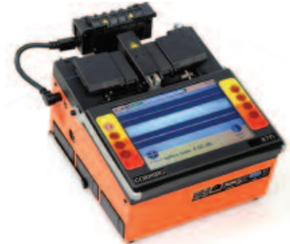
Model X77i Micro Fusion Splicer | Photo LAN787