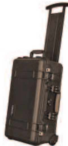
Model X77i Micro Fusion Splicer Carry-On Case | Photo NS81