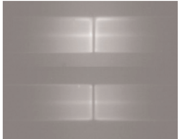
Core Detection System Technology (CDS) | Photo NS135

The X77i is now equipped with a secondary method for core alignment (CDS) based on cameras. This technology, although not as accurate as the LID-SYSTEM, allows for fast core alignment (15s) even on 900 \mu\text{m} single-mode fibers. The X77i is also capable of automatically choosing the best alignment method for the application at hand.