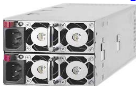
Dimensions: 101(W) x 84(H) x 300(D) mm

460+460 watts Output Power N+1 Redundant Configuration Meet 2U Rack Mount System