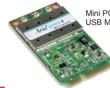
Mini PCI-e Card USB Mini Card