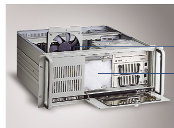
One 85-CFM hot-swap cooling fan