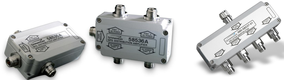
58535A and 58536A GPS Active Splitters

Power is conveniently obtained from the GPS receiver(s) connected to the amplifier. This eliminates the need for a separate dc power supply and wiring. DC power applied to the splitter is also passed on for use by an active antenna, further simplifying your installation. The 58535A (2 outputs), 58536A (4 outputs), and 090-58537-01 (4 outputs) obtain power from a GPS receiver connected to any port. The 58517A (8 outputs) receives power from the GPS receiver connected to port 1, and has an optional external DC connection if needed.