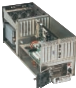
TR6C-S showing hot swap power supply