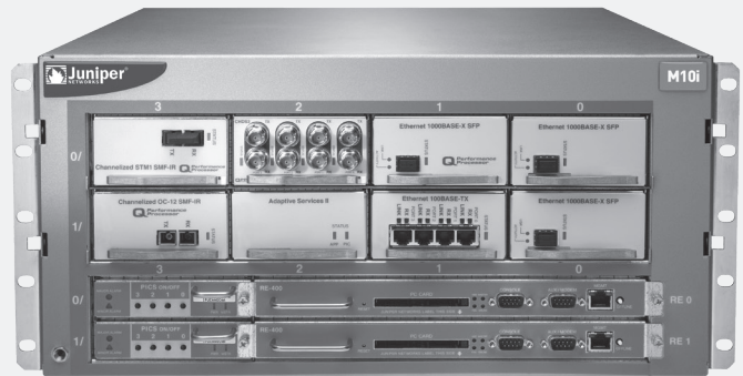
M10i Multiservice Edge Router