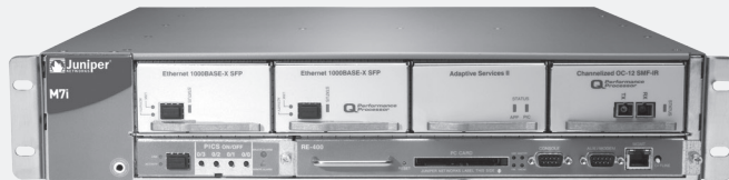
M7i Multiservice Edge Router

All M Series routers support highly scalable J-Protect filtering capabilities, unicast reverse path forwarding and high-performance rate limiting for industry-leading Denial of Service (DOS) attack protection. The J-Protect security capabilities of the M Series can be further enhanced with the Multiservices PIC, hardware that accelerates additional network-based security services such as high-speed NAT, stateful firewall with attack detection and J-Flow accounting. With the rich feature set of Junos OS combined with industry-leading ASIC technology, M Series service-built edge routing provides a new level of reliable and secure service delivery at the edge of service-provider networks.