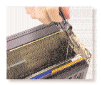
FlexPAC - Easily Accessible Expansion Bay