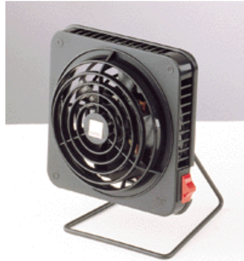
3037 Breezy Portable