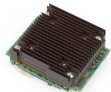
For air cooling (optional)