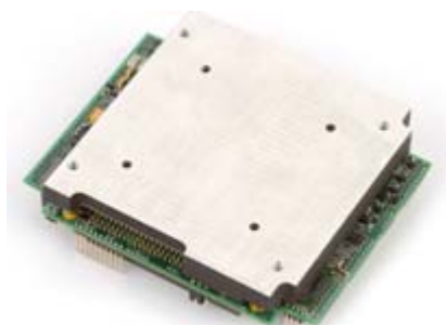
For conduction cooling (supplied with the board)