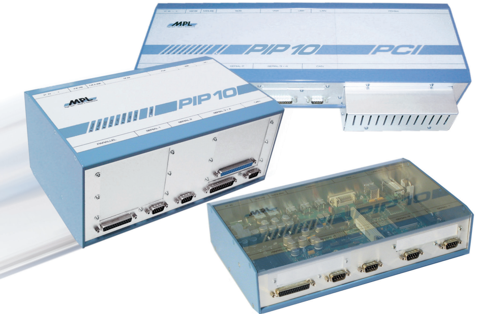
PIP10 in various rugged aluminum housings with best EMI/RFI protection (inside chromated, externally powder coated or eloxated)

the PIP10 to the ideal solution for any application where a high performance PC with a low power consumption is required. Additionally you benefit from a high quality, very rugged, small size, and expandable Industrial PC solution. The PIP10 is widely used in vision, medicine, defense, transportation, telecom, and in industrial applications.